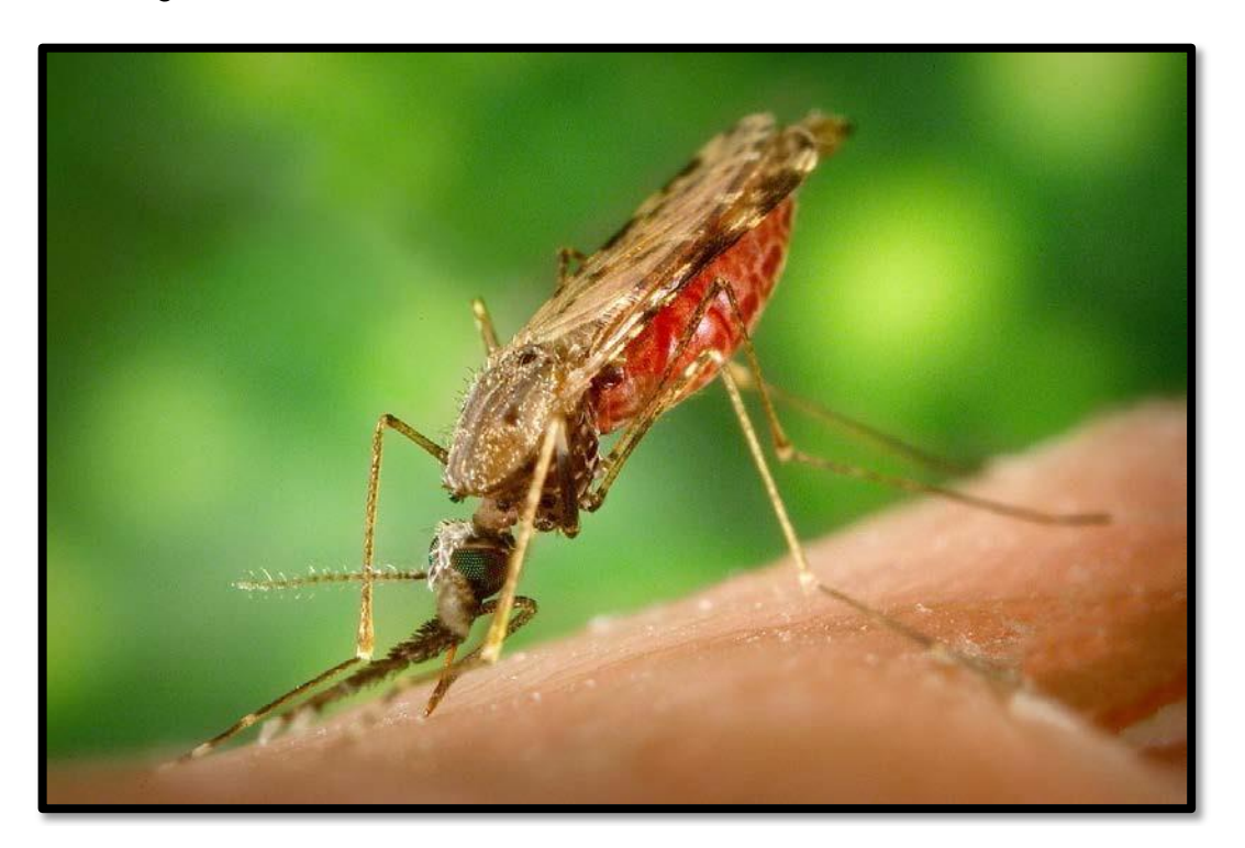
Figure 2: An Anopheles gambiae complex mosquito drawing a blood meal from a human host. Source: Photo Credit: James Gathany Content Providers(s): Centers for Disease Control and Prevention's Public Health Image Library (PHIL), with identification number #7861 .