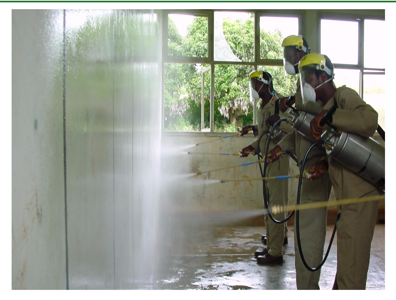
Figure 3: Indoor residual spraying of a house in South Africa.